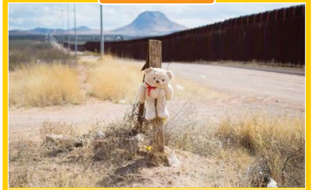
A teddy bear is tied to a post with barbed wire next to the border fence with Mexico in Douglas, Arizona, the US.