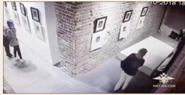
A young woman trying to take a selfie knocked over two works of art at a gallery in Yekaterinburg, Russia, on October 27, 2018.

According to TASS, include a Francisco Goya etching from the Los Caprichos series and Salvador Dali's interpretation of it. Goya's work was also part of the gallery owner's private collection.