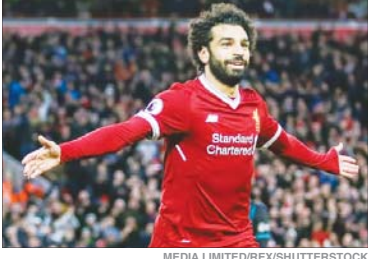
Mohamed Salah celebrates a goal for Liverpool.