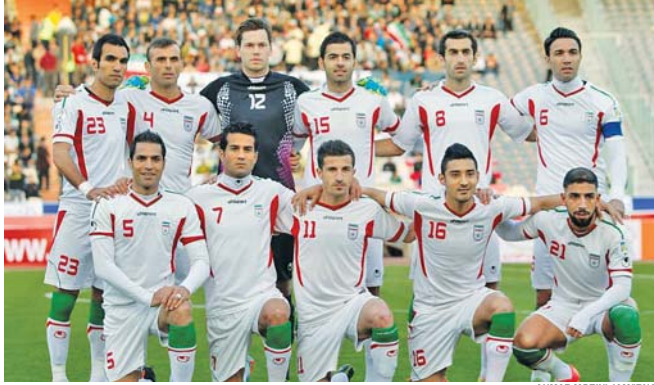
Iran football team posing for a team photo